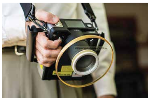
The neck strap protects the Image-Vet FleXX™ and allows for simple and easy one-handed operation, allowing the user total FleXXibility to operate acquisition software, position the digital sensor or tend to the patient.

- DR. KATE KNUDSON (VETERINARY ECONOMICS - Case Studies: Make sure new equipment earns its keep)