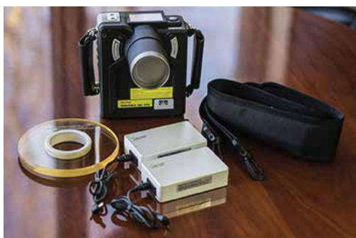
The Image-Vet FleXX™ requires NO installation or assembly. Its two rechargeable batteries, neck strap and back scatter shield all fit conveniently in the supplied hard-shelled transport case (not pictured).